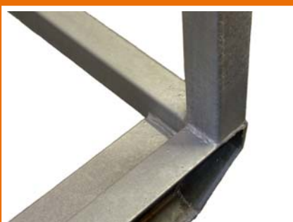
Hot Dip Galvanized Frame.