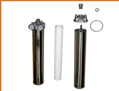
Strainers & Filtration.