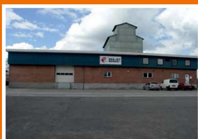
DEN-JET Factory Denmark