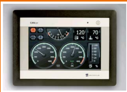
Electronic Engine Controller.