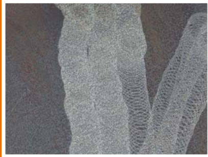
Water Blasting With Rotating Nozzles.