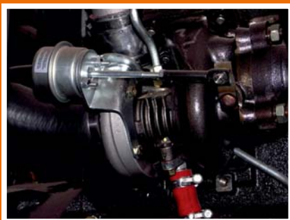
4 Cyl. Turbo Diesel Engine.